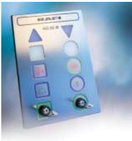
RG 85 III System

Single parts, accessories and illumination No directive applies for these products.