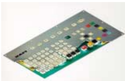
RF 15 with RK 90 System

Marking The marking will be corresponding to the Low-Voltage Directive 73/23/EWG resp. the Directive "CE-Marking 93/68/EWG" either on the packing or on the product itself or on the shipping documents.